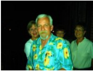
Phenix City, AL

RE: Bakerville USA, April 2011, Impromptu Chat Posted Monday, April 18, 2011 at 8:41 AM