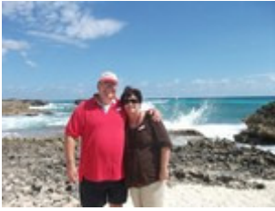
New Brockton, Ala

RE: Bakerville USA, April 2011, Impromptu Chat Posted Monday, April 18, 2011 at 10:53 AM