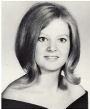
Richmond Hill, Ga.

RE: Bakerville USA, April 2011, Impromptu Chat Posted Sunday, April 17, 2011 at 5:15 PM